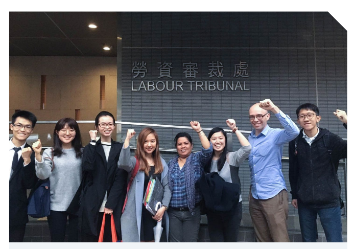
Justice without Borders, with partners including FADWU and the Hong Kong Confederation of Trade Unions, after a landmark decision on a client's case, making access to video conferencing in Hong Kong (China) courts a reality for migrant workers, so they can pursue justice after they return home

The collaboration of trade unions between the countries of origin and countries of destination may be particularly efficient and valuable, including in service provision to migrant workers. A strong link exists between unions in the Philippines and Hong Kong (China), in particular between the SENTRO and the PLU Hong Kong (China). This collaboration has allowed the design of coordinated interventions at both ends of the corridor and the sharing of information on the issues and concerns in Hong Kong (China) (for Filipinos workers) and in the Philippines (for return migrants). The International Domestic Workers Federation has fostered this collaboration by playing a coordination role.