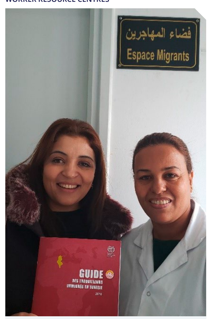
UGTT focal point and ILO FAIR II Project National Project Officer at the Migrant Resource Centre in Sfax, Tunisia, December 2019

The process of service provision for migrant workers led by the Tunisian General Labour Union (UGTT) is an example of emerging good practice and a replicable model. With the support of the <u>ILO's FAIR</u> project, UGTT began discussions on the protection and organisation of migrant workers in Tunisia in light of changing migrant trends in Tunisia. ILO, UGTT and civil society met with migrant workers employed in various sectors to better understand their needs and the challenges they faced. After this awarenessraising period, UGTT engaged in participatory strategic planning. They developed an action plan based on a series of dialogue sessions with members and migrant workers which allowed them to identify the specific needs of the Tunisian context. UGTT launched a regional network of focal points on labour migration across Tunisia, responsible for being the first point of contact for migrant workers.