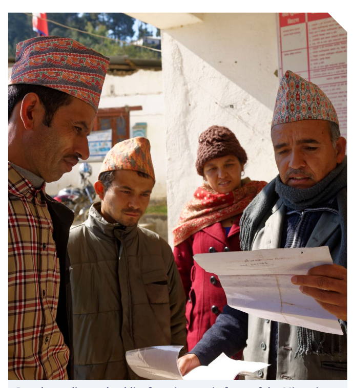
People reading a checklist for migrants in front of the Migration Resource Centre (MRC) in Charikot, Dolakha district, Nepal