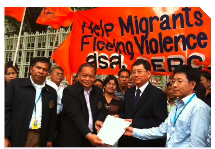
Thai trade unions protest for migrants' rights in front of the ILO Office in Bangkok

In September 2010, the State Enterprise Workers Relations Confederation (SERC) – a confederation of 43 unions in Thailand – made a submission of a comment to the ILO's Committee of Experts on the