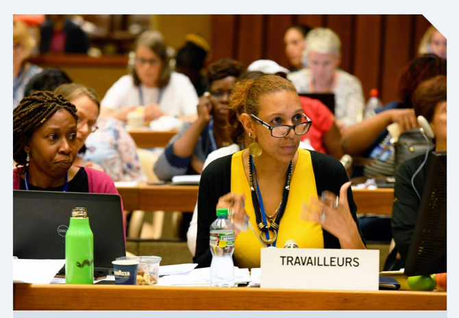
Workers' representatives speak at the Committee on violence and harassment in the world of work. 107th Session of the International Labour Conference. Geneva, 2 June 2018.

country, that convey the unacceptability of violence and harassment, in particular gender-based violence and harassment, address discriminatory attitudes and prevent stigmatization of victims, complainants, witnesses and whistle-blowers".