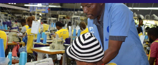
▶ TVET graduate, beneficiary of ILO's support to the digital transformation of TVET in Cambodia.