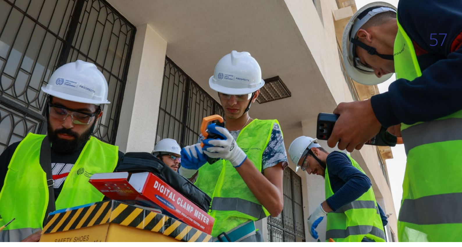
Students wear OSH gear and equipment before installing solar panels on the roof of one of the TVET schools in northern Lebanon.