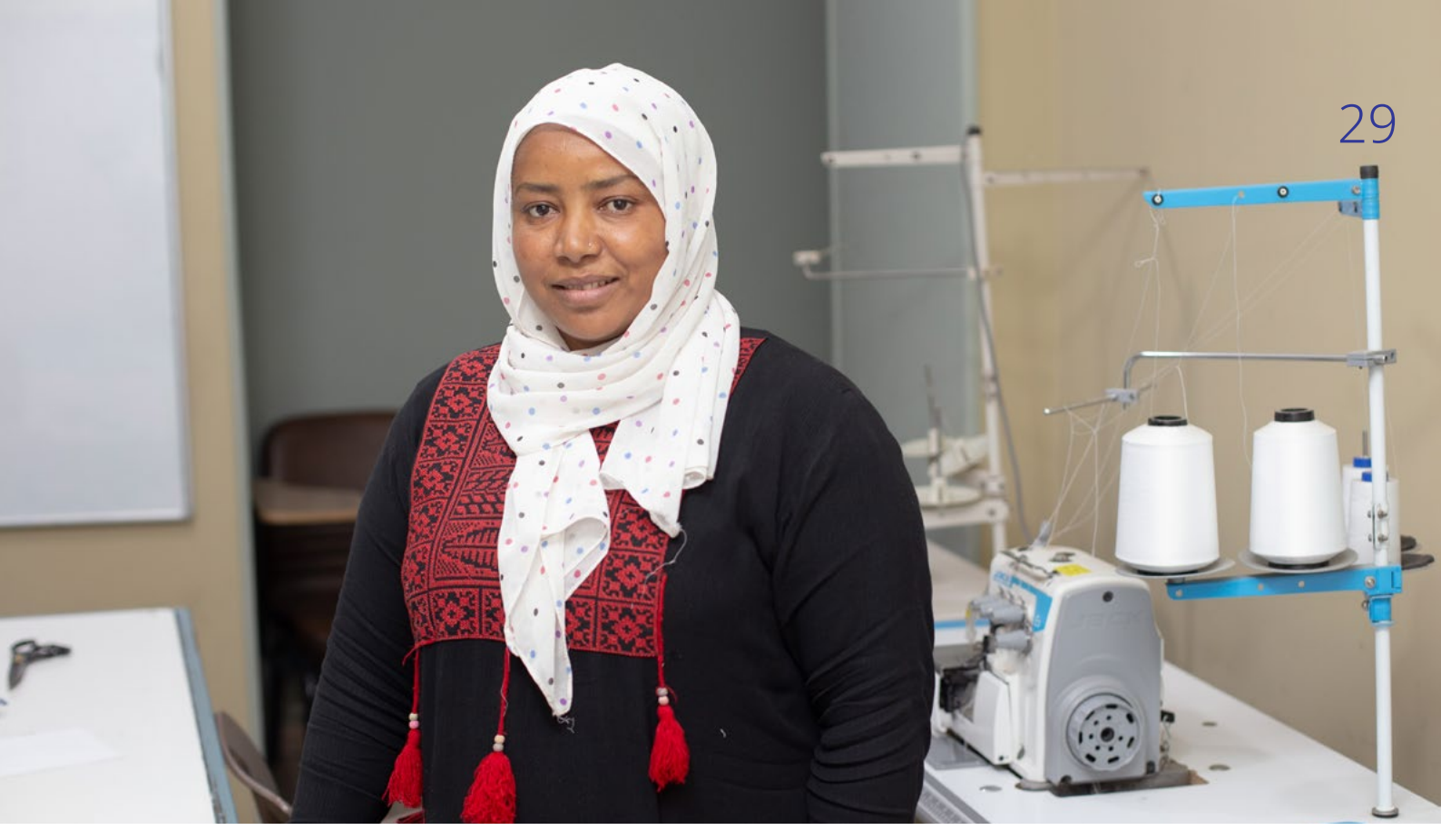
Sudanese refugee in Egypt trained on tailoring skills and supported to start her business.