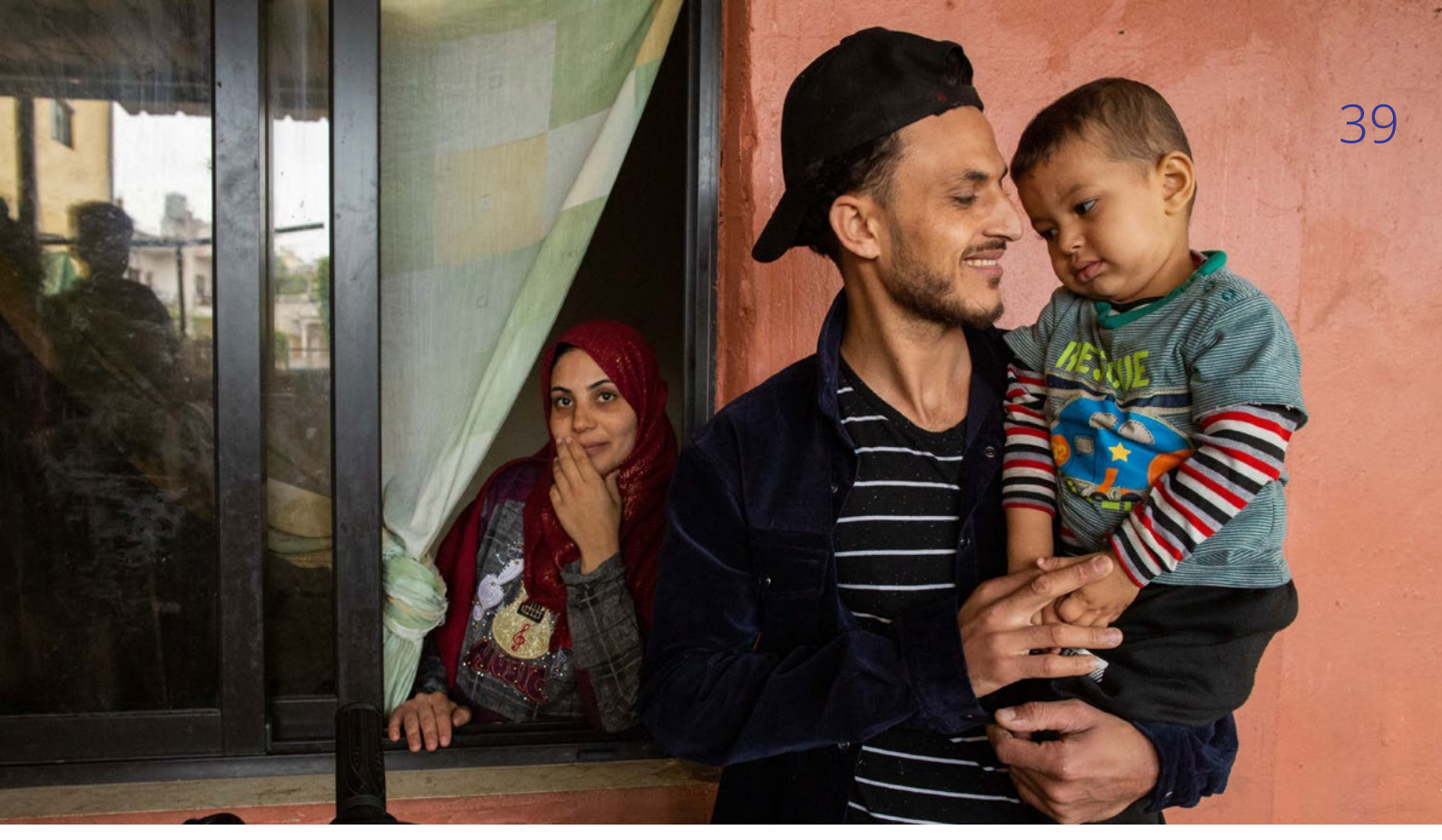
A Syrian family with their children sharing a house with other refugee families in Lebanon's capital Beirut.