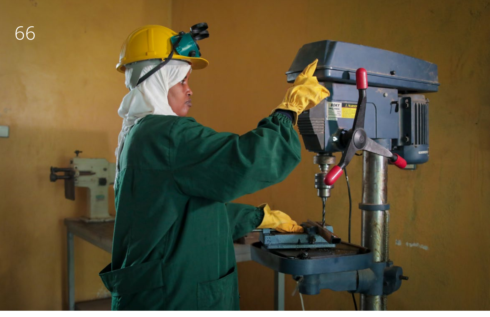
A refugee community woman from Somali region in Ethiopia getting trained on vocational skills at Jigjiga Polytechnic.

By contrast, Sudan, Ethiopia, Uganda and Kenya have more permissive naturalization policies, and a legal infrastructure is largely in place for non-nationals to obtain citizenship, at least in theory. In Sudan, after ten years of residing in the country earning a lawful living, refugees are eligible to apply.<sup>145</sup> There is an exception for South Sudanese, who are automatically eligible for citizenship if they were born to a Sudanese mother or father, a requirement met by anyone born before 9 July 2011.<sup>146</sup> In Kenya, this requirement is only seven years,<sup>147</sup> and additionally requires applicants to be a resident under the authority of a valid work permit. In Ethiopia, the Refugee Proclamation includes a provision on naturalization whereby every recognized refugee who fulfils the necessary requirements of the Ethiopian Nationality Law may apply to acquire Ethiopian nationality.<sup>148</sup> However, in these countries, the requirement of a "lawful living" and a valid work permit poses a potential challenge for refugees who struggle to secure formal employment. In Uganda, it is required that a person reside in the country for at least 20 years before they are eligible to apply for citizenship <sup>149</sup>. Therefore, while in theory the pathway to citizenship is more attainable in the African context than in MENA, there are still significant legal challenges for refugees.